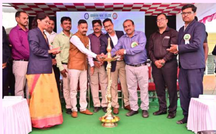
Deep Prajwalan by respected dignitaries